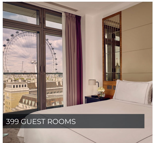
399 GUEST ROOMS