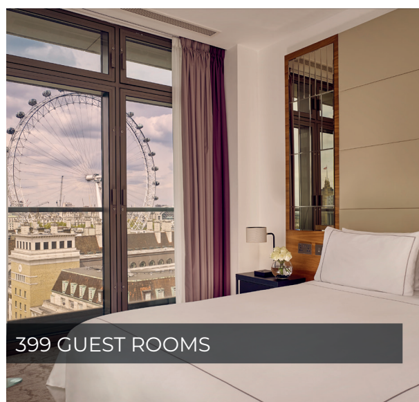
399 GUEST ROOMS