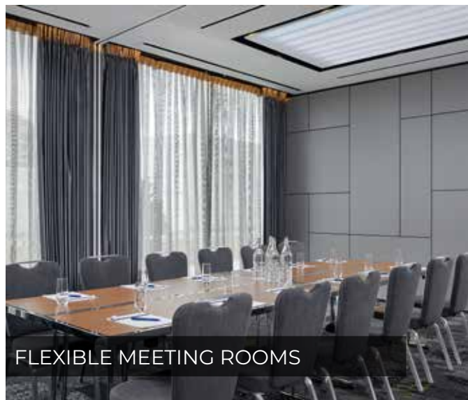
FLEXIBLE MEETING ROOMS