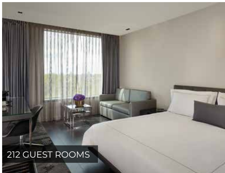
212 GUEST ROOMS