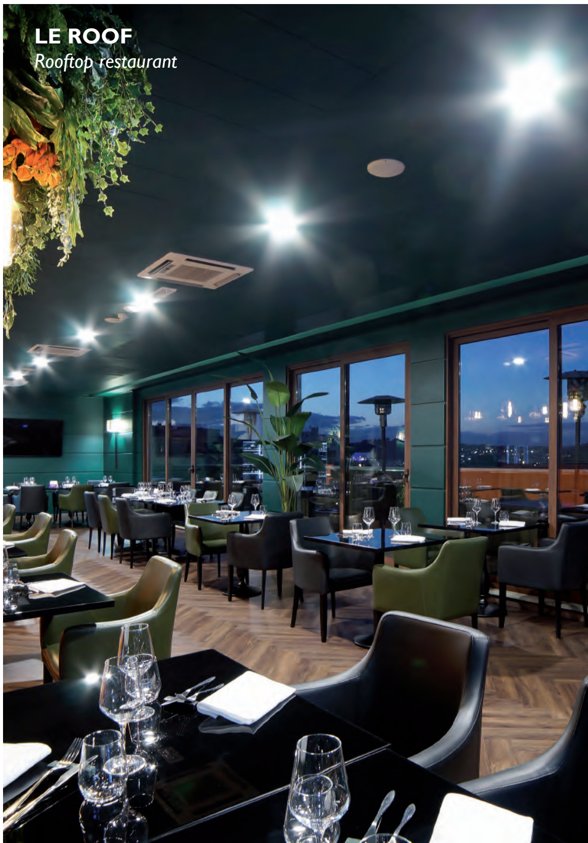
LE ROOF Rooftop restaurant