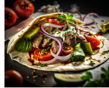
GREEK TAVERN Greek chicken pitta Gyros oregano natural yogurt & lime wedge

MASALA MAGIC INDIAN HUT Tandoori chicken - served in Peshawar naan chapati skewered bhagee, samosa & mango chutney